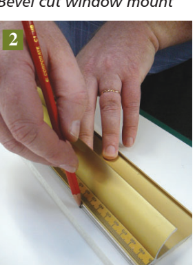
than longest opening.