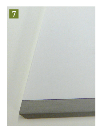
Bevel cut end of strip